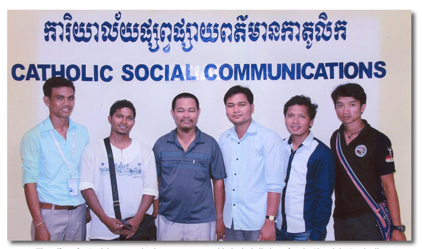
The offices for Social communications can operate with the jurisdiction of each Church in Cambodia