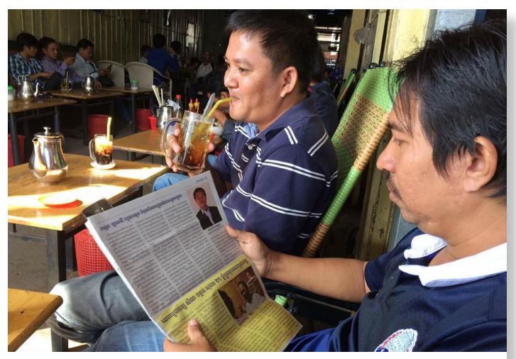
People enjoy reading the Messeger at coffee shop in Phnom Penh