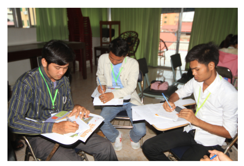
Young people join workshop on Media Communication