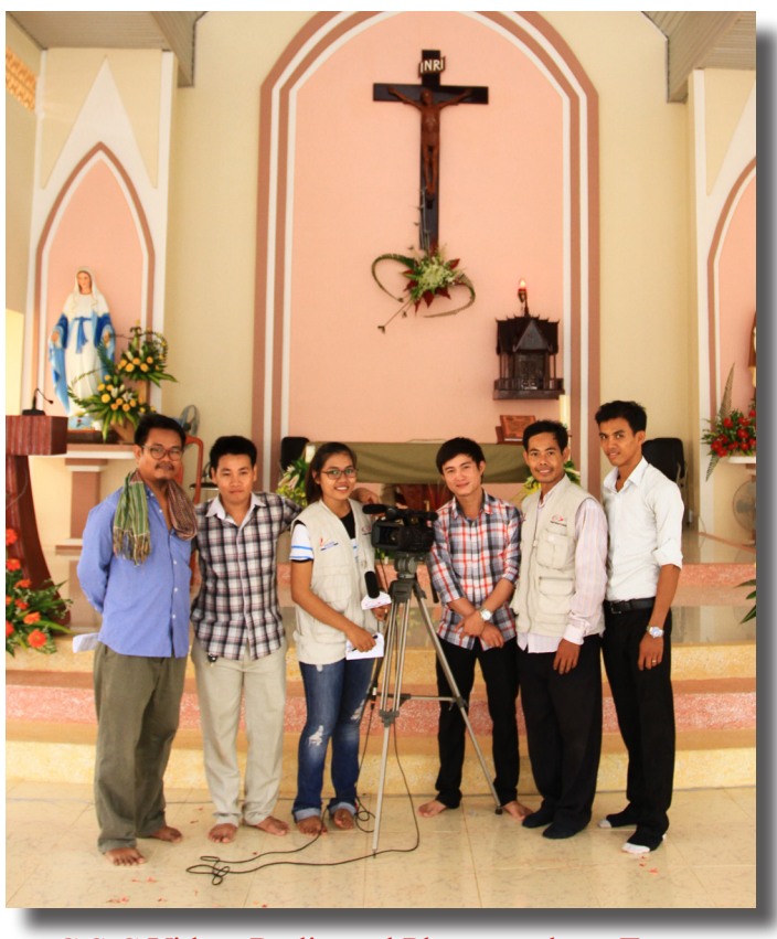
C.S.C Video, Radio and Photographyer Team