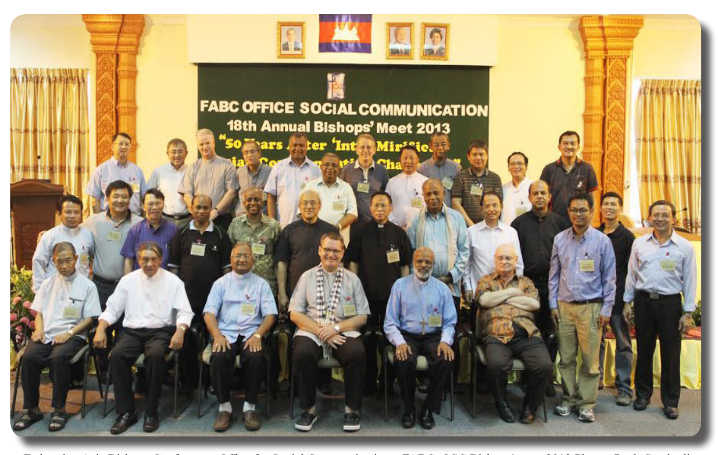
Federation Asia Bishops Conference- Office for Social Communications- FABC_OSC Bishops' meet 2013 Phnom Penh Cambodia