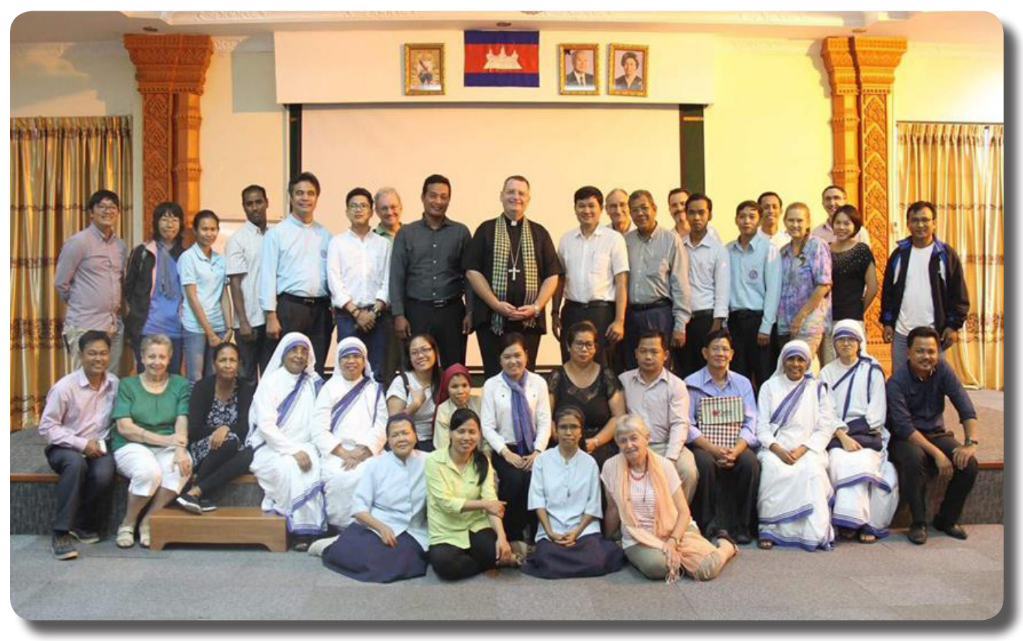
Catholic Alliance for Charity and Development - CACD