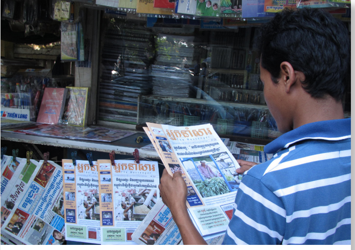
A young man enjoy reading the Messeger at Newsstands in Phnom Penh