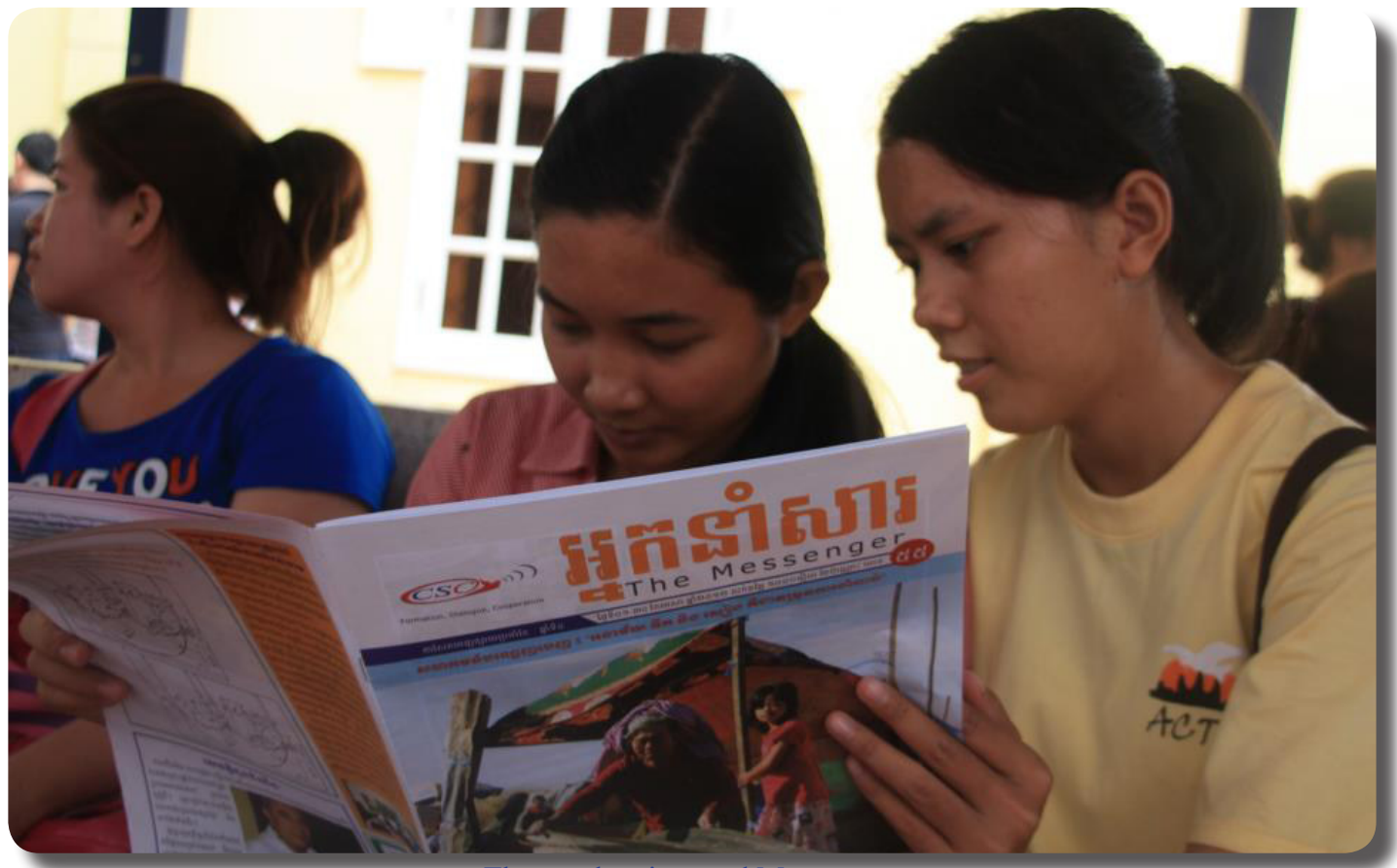
The youth enjoy read Messeger

The Messenger desk also gives services, design and print books, posters, letters, and flyers according to need of the Church.